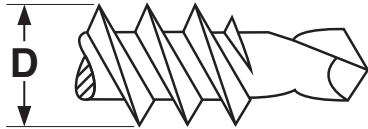
Fine Thread Drill Point Drywall Screw